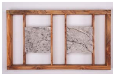
Trent Burkett, CA, "Crystal River II and III," rock castings in wood frame (2013)