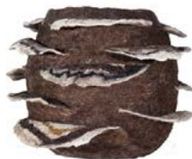
Jill Scher, CO, "Mushroom Vessel," felted hand-dyed wool sculpture (2013)