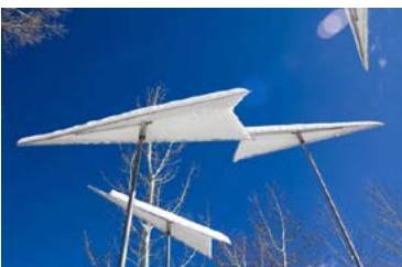
Terry Talty / Stuart Bremner, CO, "Aerovanes," metal sculpture (2012)