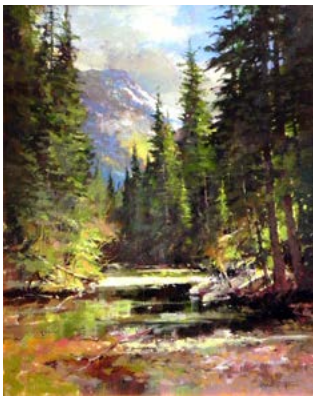
Maris Platais, MA, "Crystal River," oil on canvas (2009)